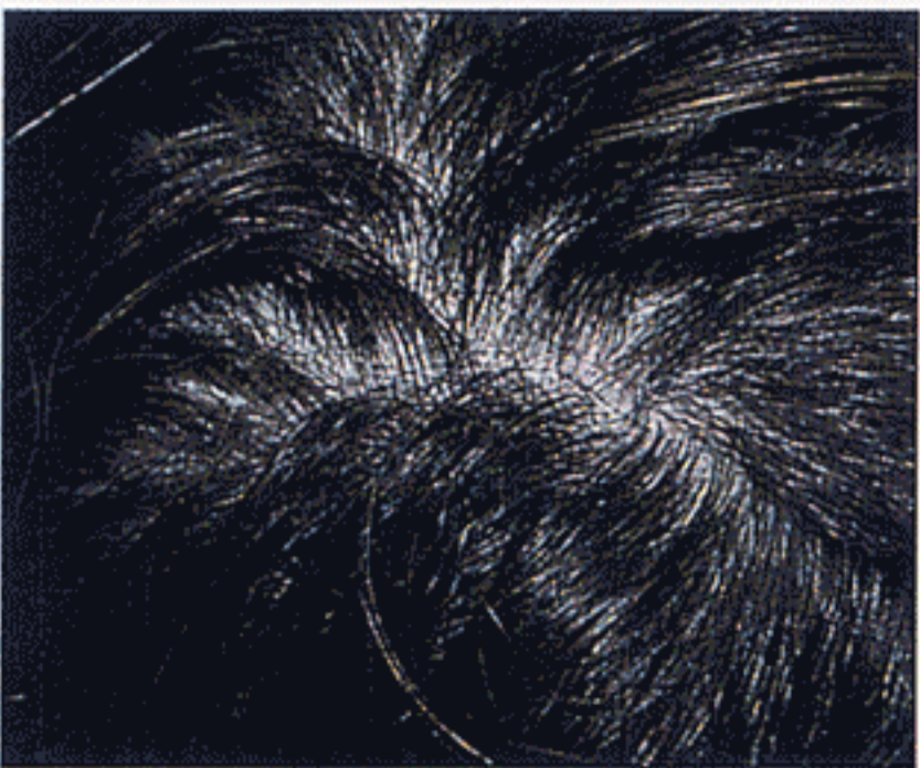
A diffusion pattern is most common among African American men and women of all races.